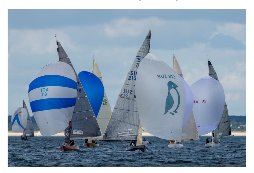
5.5 IC World Championship 2024